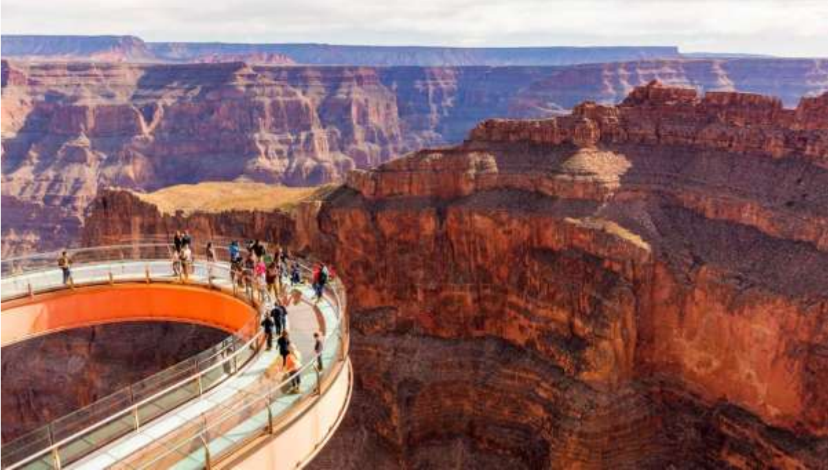
Return to Las Vegas to enjoy an eventful evening at your own leisure.

The Grand Canyon is a deep gorge which was carved by the Colorado River over millions of years. When John Newberry proposed this theory in 1858, it shook the world as it proved that the earth was much older than what people imagined at the time. The rocky landscape of the Grand Canyon National Park is mesmerising and the sight is bound to stay with you for the rest of your life. Enjoy a thrilling experiencing of walking over the Grand Canyon skywalk - a glass bridge protruding from a cliff which allows you to peer at the canyon floor 4000 ft below.