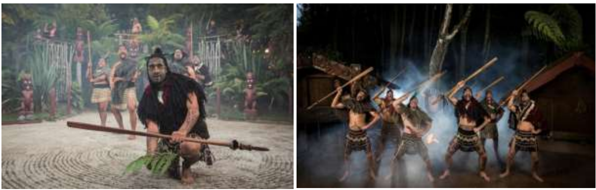
Overnight stay at the hotel in Rotorua.

ceremony, master storytellers will inform you about Maori customs and way of life and you can participate in numerous cultural activities such as hakka (war cry), weaving and weapon training. Watch the food being cooked under the earth in hot pits. The evening culminates with a traditional Maori dinner.