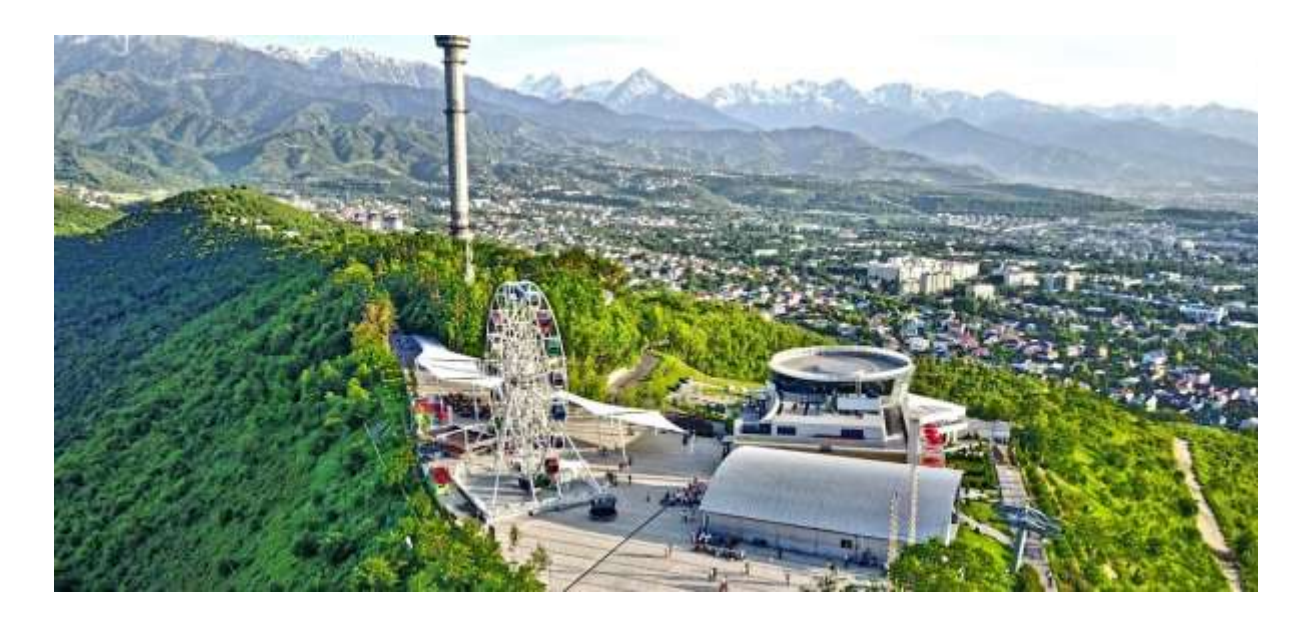
Overnight Stay at the hotel

Later, proceed to the Kok-Tobe Hills, which offer panoramic views of Almaty city. Visitors can take a cable car up to the hill and enjoy the views from the observation deck or explore the area, which includes a park, a restaurant, and a souvenir market. There is a 372 meters tall TV Tower at the foot of the mountain visible from most parts of the city.