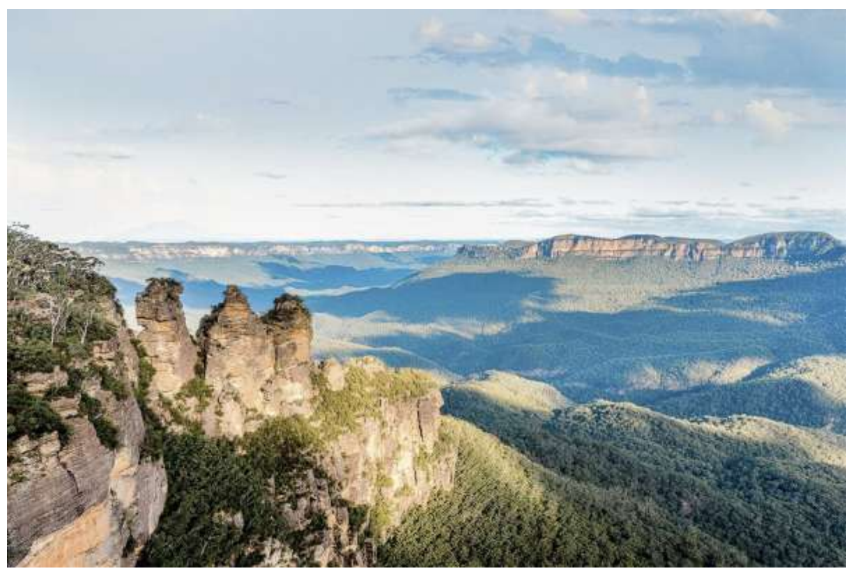
Overnight stay at the hotel in Sydney.