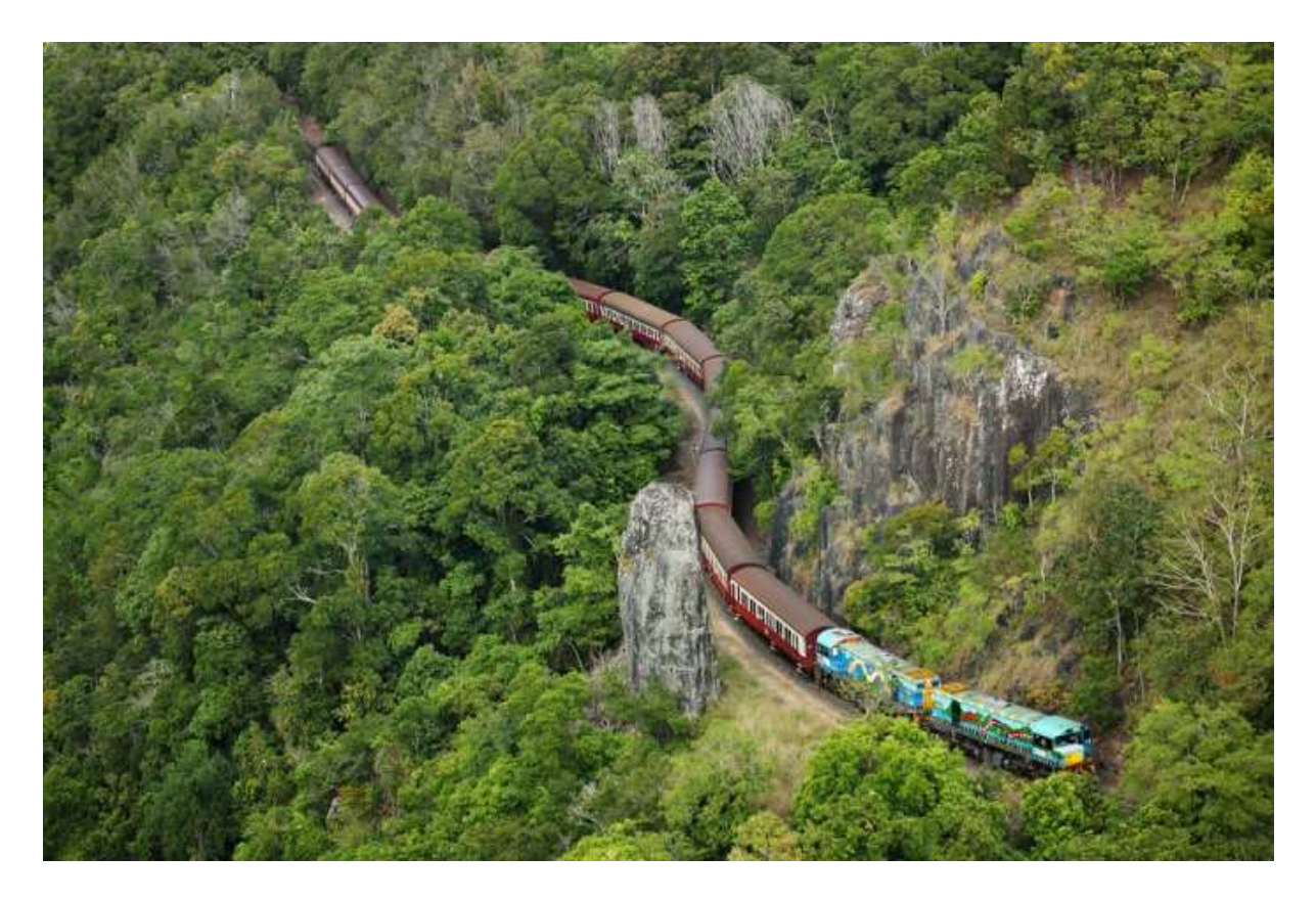
Finally return to Cairns on the scenic railway and overnight stay at the hotel in Cairns.