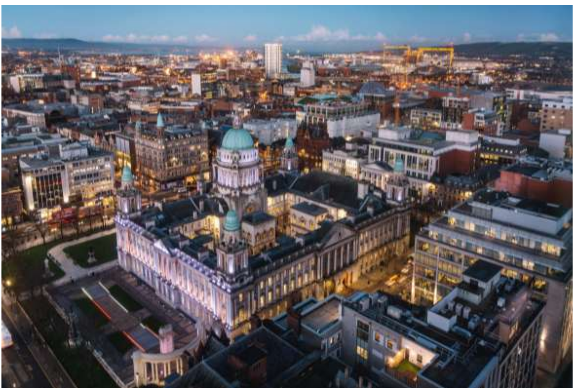
This day is free for your leisure. You can explore the city on your own. Overnight stay at hotel in Belfast.

The capital of Northern Ireland is Belfast. The RMS Titanic was born there and famously sank in 1912 after colliding with an iceberg. The Titanic Belfast, an aluminium-clad museum resembling a ship's hull, as well as the shipbuilder Harland & Wolff's Drawing Offices and the Titanic Slipways, which today hold outdoor concerts, are just a few of the places in the refurbished dockyards where this heritage is remembered.