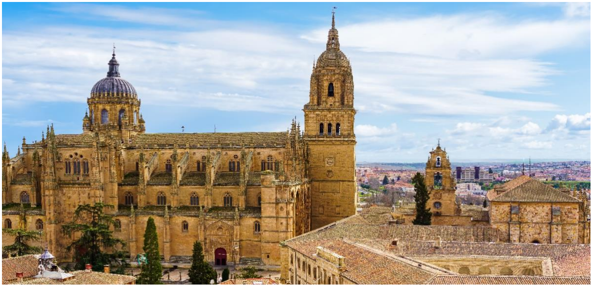
Overnight in Porto (Breakfast, Lunch, Dinner)