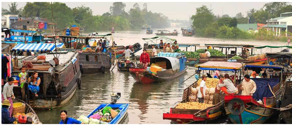
performed by native artists. Next, you will change to a paddle boat to cruise through the narrow canals and visit households with traditional occupations of home-based coconut candy and rice-wine making. Continue travel by motorized boat to another island to visit