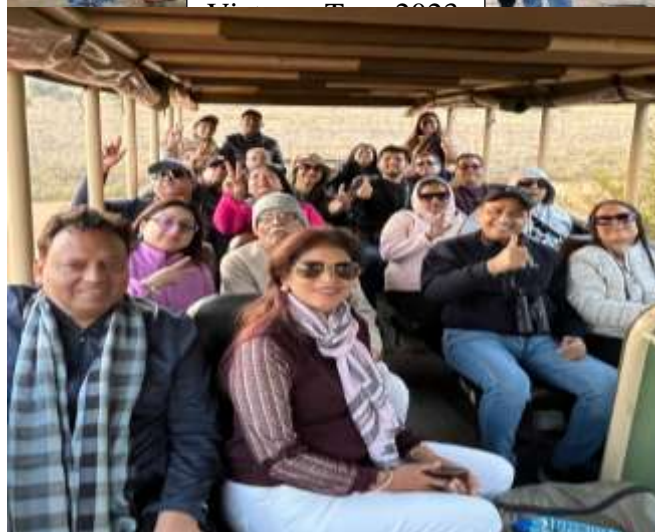
London & Scotland Tour 2019