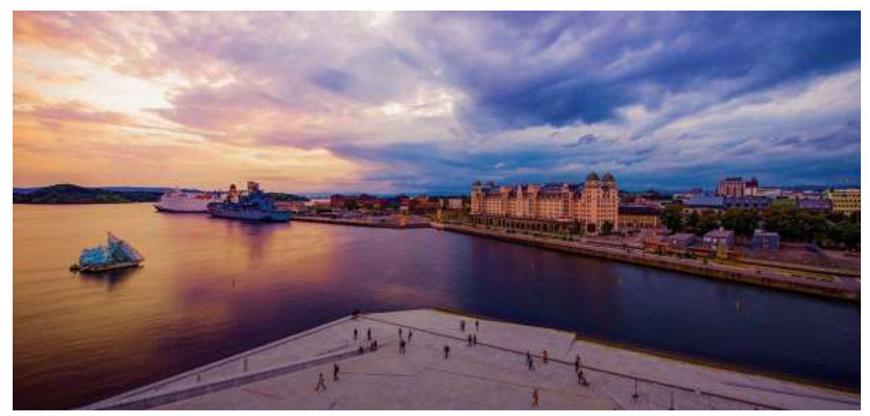
Upon reaching Oslo, check-in at your hotel. Later, proceed for a sight-seeing tour of the city:

We will begin the tour with a visit to the Viking ship museum which contains the world's best preserved Viking ships. These beautiful vessels were extracted from Viking grave sites where they were buried along with their rich owners. The next stop will be the Oslo City Hall. Every year in December, The Nobel Peace Prize is awarded in the City Hall to the deserving candidate since 1901. After the tour of city hall, we will proceed to the Opera house. Immerse in the views of the city from the rooftop where you can see fjord archipelago, city core and mountains surrounding Oslo. Later proceed to Vigeland Park which is the World's largest sculpture park by a single artist and is a must visit! This park consists of approx. 212 stunning statues made by artist Gustav Vigeland.