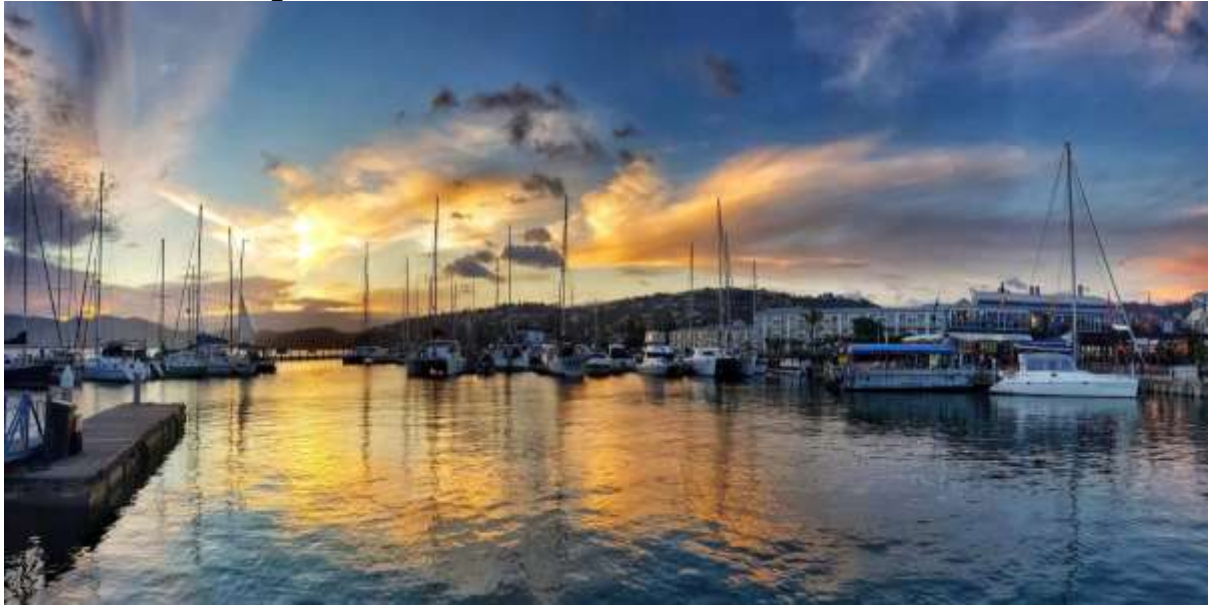
Arrive at hotel and proceed for Check-in. Rest of the day is free for you to explore Knysna on your own.

Afterwards, proceed to Knsyna. Knysna is a quaint town located in the heart of the world famous Garden Route National Park. The National Park is home to a wide variety of vegetation, wildlife and topography including beaches, mountains, forests, lakes and lagoons. Knysna is itself located on the Knsna Lagoon, a warm water estuary and is home to some of the best golf courses in the world.