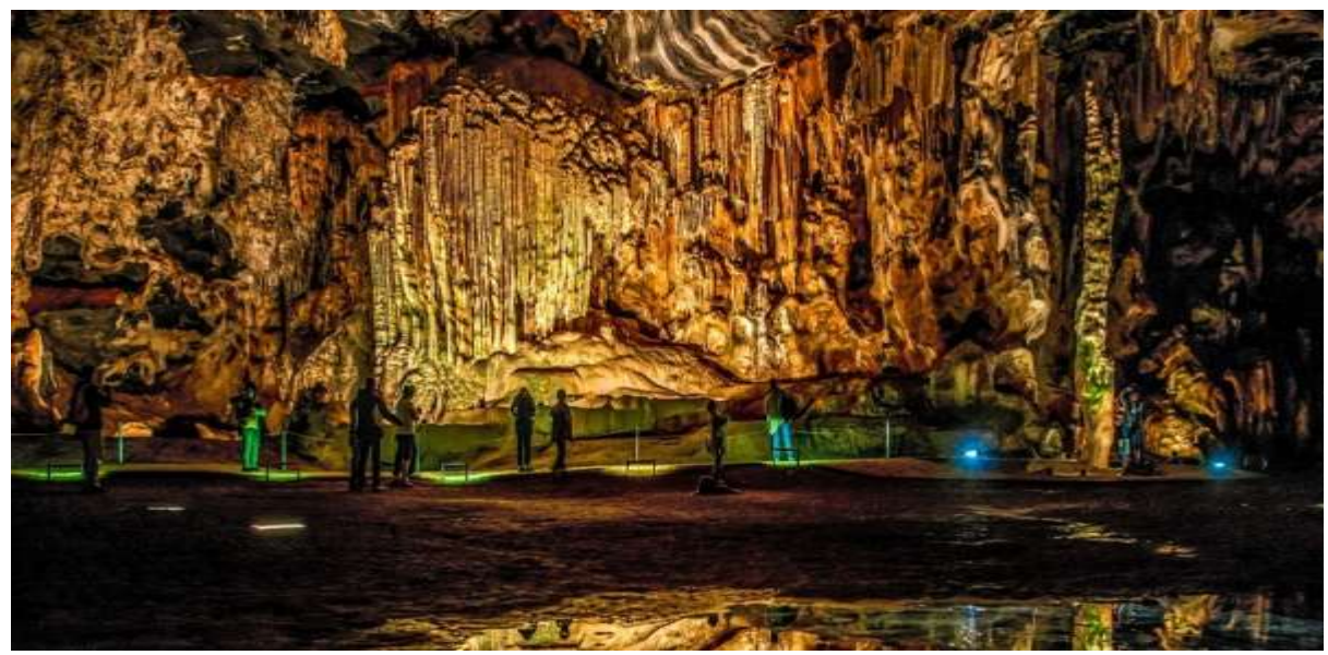
We start the tour with a visit to Cango caves. These are 20 million year-old underground cave system that have been recognised as one of the greatest natural wonders of the

After breakfast at the hotel, we will proceed for a fun day out at Oudtshoorn - a charming town located in the heart of the Klein Karoo region in South Africa. It is known as the ostrich capital of the world.