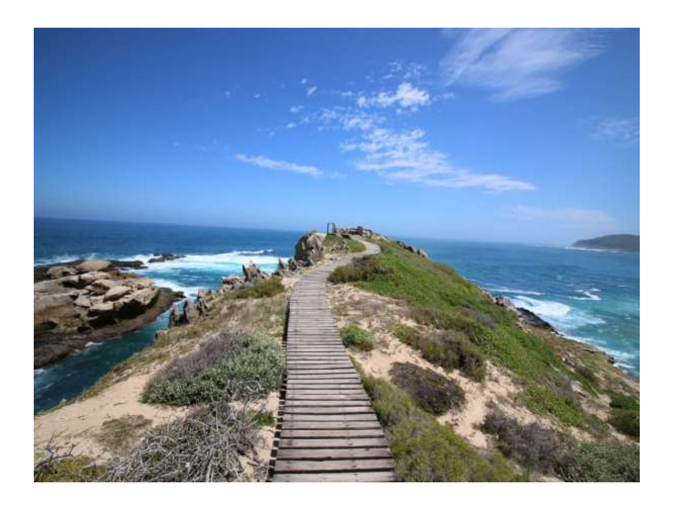
----- End of service -----