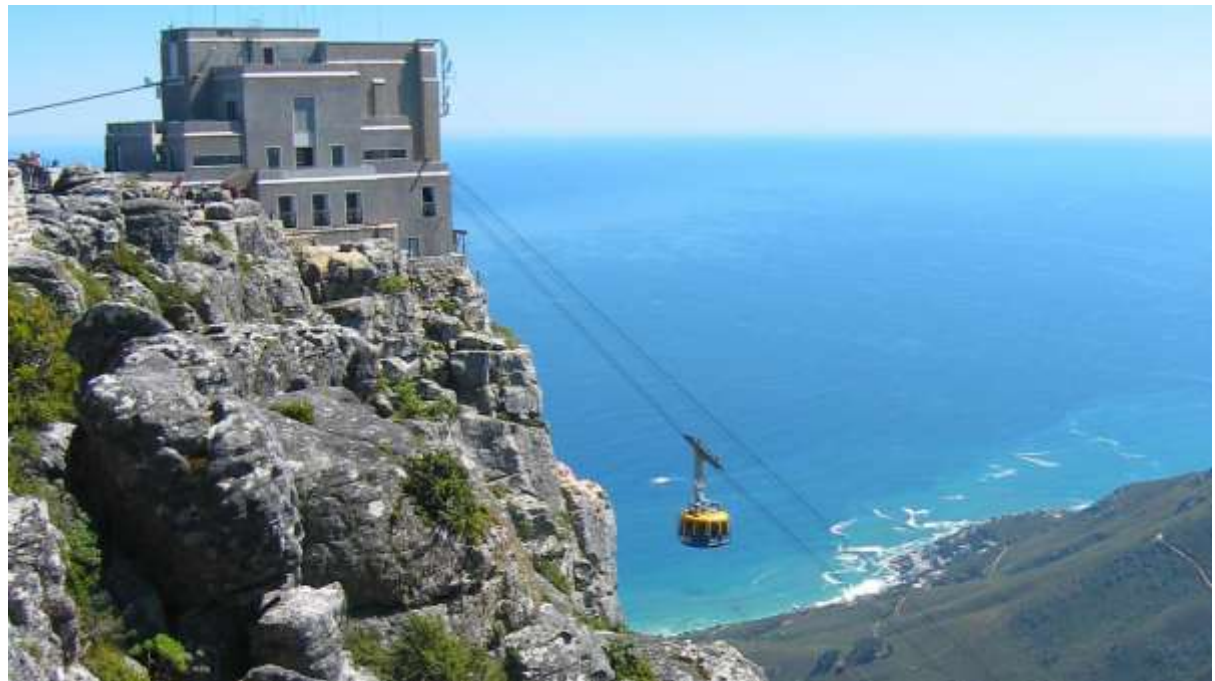
Later, visit key landmarks, experience the vibrant atmosphere of the city's streets, and discover the fusion of modernity with the echoes of the past.

In the afternoon, immerse yourself in the vibrant energy of Cape Town with a Half-day City Tour. Visit the iconic Table Mountain, a majestic natural wonder that offers breathtaking panoramic views of Cape Town and its surroundings. A revolving cable car to the top offers mesmerising panoramic views of the city. Aside from being the country's most photographed attraction and the perfect place to take photos of the landscape of Cape Town, it is also home to about 2,200 species of plants and 1,470 floral species, many of which are endemic to the mountain.